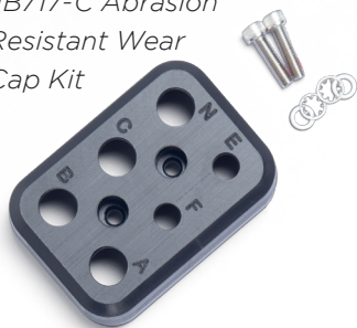
JB717-C Abrasion Resistant Wear Cap Kit