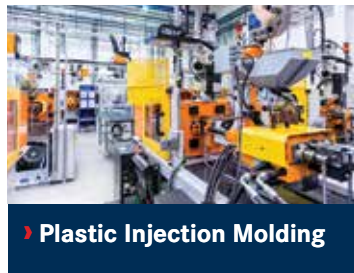
› Plastic Injection Molding