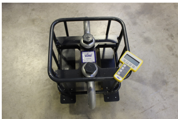
Load cell in steel protection cage

Polyester round slings comply with DIN EN 1492-2