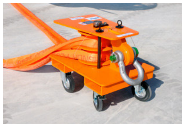
Pulley 60t with round sling